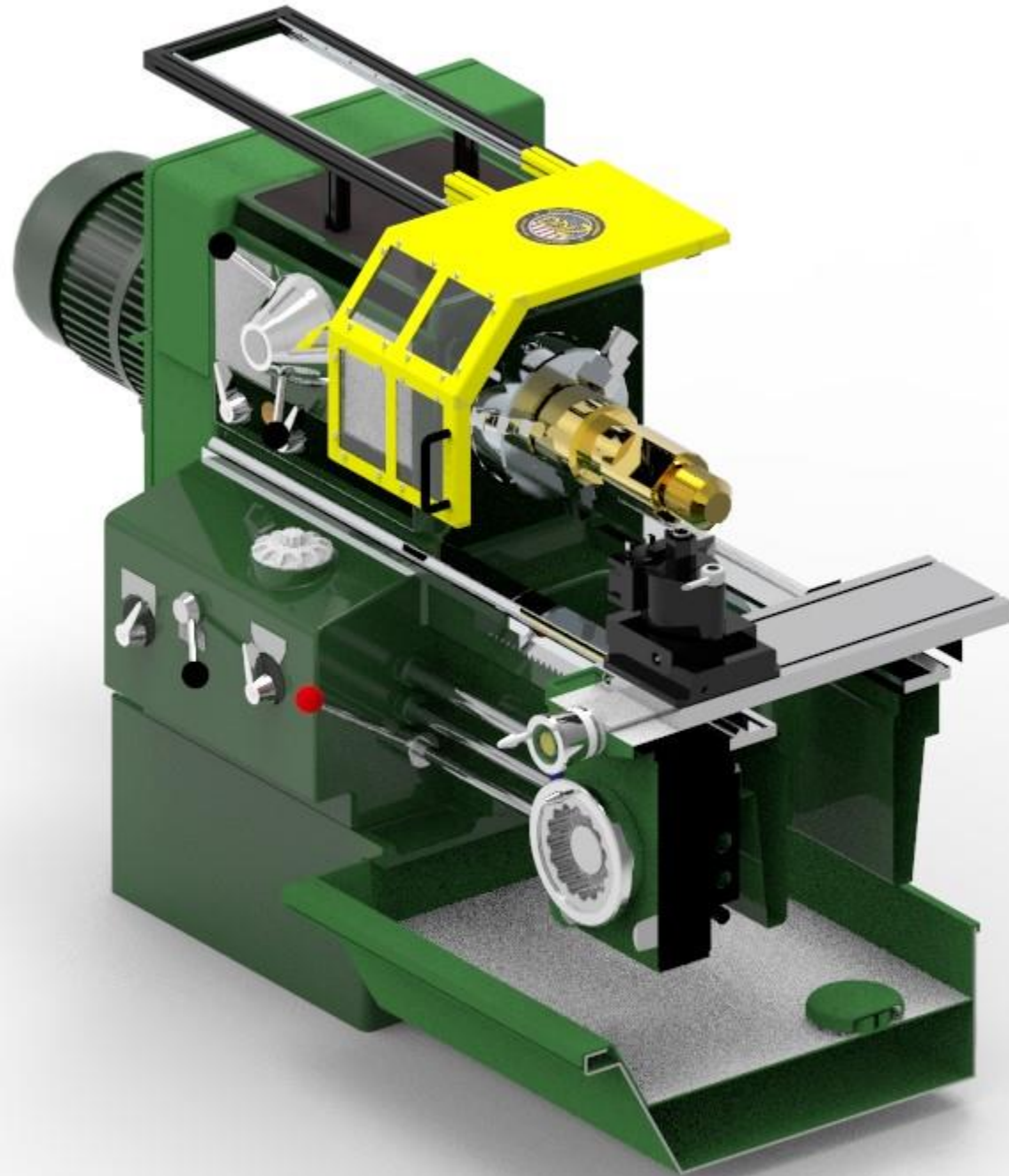
Image shows standard 16" wide guard, 25" side slide travel, 17" center of chuck to guard face clearance and 2" past centerline vertical guard height