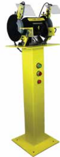
ODIZ SAFETY, LLC